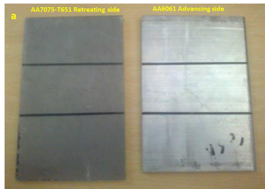
Figure1: Dissimilar Aluminium Alloy Plates

The work table with (700 x 350mm) dimension consists of two axis movements. The first movement is along the table length (X-axis), which is controlled by hydraulic control unit. The second movement is crosswise (Y-axis), which is controlled manually. Specially designed fixtures are employed to hold the work piece rigidly. The work table consists of maximum stroke length 600mm. Single pass butt welding procedure was used to fabricate the dissimilar AA7075-T651 and AA6061 FSW joints in the plates size of 150x150x6mm Friction stir welding process parameters, namely tool rotational speed, tool traverse speed and axial force are kept as constant for fabricating the dissimilar alloy joint. Tool speed is set as 2000rpm, traverse speed is fixed as 60mm/min and the axial force is set as 2kN. Tool tilt angle, tool offset and tool pin diameter are varied according to the feasible range observed from trial experimental runs. These FSW parameters are optimized to attain the maximum tensile strength and hardness of the weld joint.