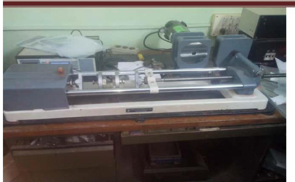
Figure 2: Tensile Testing Machine