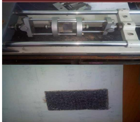
Figure 4: Figure Specimen for testing compression