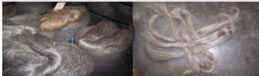
retting is 80 °C retting. The rate for optimum temperature and is 100% as water water knoin F.

Jute is a best fiber obtained from inner bast tissues of the plant stem. The fibers are bound together by gummy materials (pectinous substances) which keep the fiber bundles cemented with non fibrous tissues of jute bark. These encircling soft tissues must be softened, dissolved and washed away so that the fiber can be obtained from the stem. This is done by steeping the stems organisms (mainly bacillus bacteria) decompose upon temperatures and the type of water used. It has been found that the presence of higher the tenacity of fiber In this research, a unidirectional type of fabric weave having a count of 20 x 12 (for yarns of 245 302 Tex) is investigated. 20 x 12 indicates 20 in number larger yarns in the wrap direction and 12 in number smaller yarns in the weft direction per inch are used. Jute fiber is 100% bio-degradable and recyclable and thus environmentally friendly. It is a natural fiber with golden and silky shine and hence called The Golden Fibre. It is the cheapest vegetable fiber procured from the best or skin of the plant's stem.